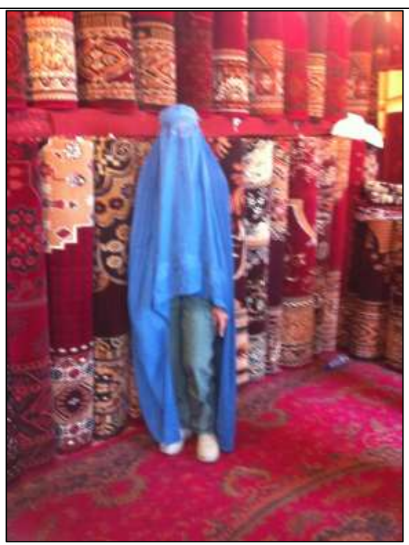
<u>Trip 2.</u> "Kabul Burka and Boots" was taken when we were out in Kabul today for "cultural experience" (shopping/dinner) in the Khair Khana district.

Women (when not in military uniform) are also strongly encouraged to wear long sleeves and to cover their hair when they are out and about. (This picture was taken around noon today; temperature was close to 100-degree F. I would've loved to roll up my sleeves!)